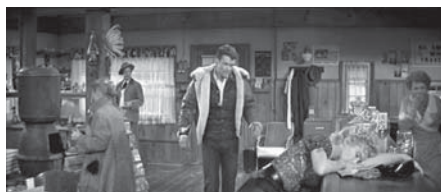
Figure 10.31 Bus Stop : A more typical ensemble shot from the same film.