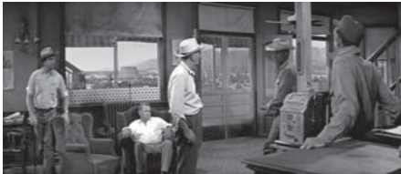
Figure 10.82 Bad Day at Black Rock : Soon Hector comes into frame center to bully the old man as Coley leaves the window and moves to the middle ground.