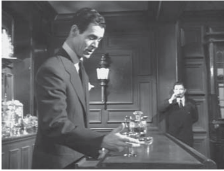
Figure 10.15 In the 1940s, recessional staging became more common, setting characters into considerable depth ( Caught , 1949).