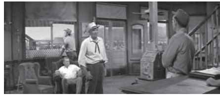
Figure 10.81 The hotel lobby in Bad Day at Black Rock (1955) is used imaginatively in each scene set there. Here the doctor tries feebly to challenge Reno's authority.