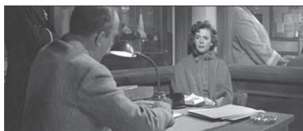
Figure 10.63 Rebel Without a Cause (1955) puts Judy in the center, framing Jim outside in the left window and revealing Plato and the family maid on the far right.