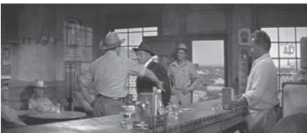
Figure 10.104 Bad Day at Black Rock : As Coley provokes Macreeedy, they advance to the middle ground, Reno now warily closer to the door's edge.