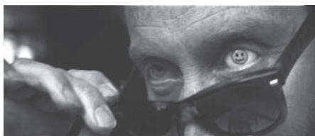
Figure 10.4 The Last Action Hero (1993): A micro-close-up gag that would have been almost impossible in traditional CinemaScope.

For the industry as a whole, 3-D, widescreen, roadshows, and stereophonic sound amounted merely to holding actions. Throughout the 1950s and 1960s attendance and box office receipts continued to plummet, eventually leveling off at around 20 million viewers a week. Those exhibitors who remained in business chopped up their theaters, offering patrons tiny screens, dim projection, and monaural sound. Most studios suffered financial crises, despite the cash coming in from TV production and the sales of film rights to broadcast networks. Hemorrhaging money, and bought and mismanaged by conglomerates, the Hollywood studios were beached behemoths by the early 1970s.