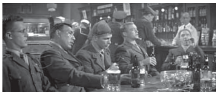
Figure 10.38 Recessive anamorphic compositions could be built around tables and other set elements ( Battle Cry , 1955).