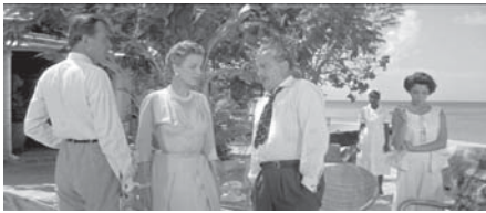
Figure 10.80 . . . before a servant, after quietly tending to her duties in the far distance, steps into a gap to announce the meal.