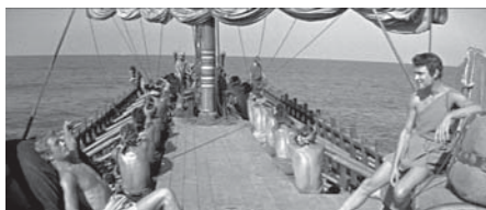
Figure 10.36 The lines of rowing sailors create vectors that culminate in Paris and Aeneas, lounging in the foreground ( Helen of Troy , 1956).