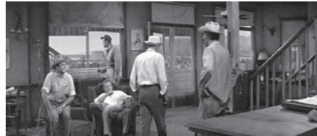
Figure 10.83 Bad Day at Black Rock : Reno goes outside as the men rearrange themselves. Throughout the film, the lobby windows create another zone of space for us to notice.

stranger, Macreeedy, while the town doctor feebly protests. When a character speaks a crucial line, he tends to come forward or mask off others, moving and occupying a spot with the precision of chessplay (Figures 10.81–10.83). Sometimes the onlookers swap places silently on the fringes of the action, resettling the composition in ways at once subtle and transparent. These small adjustments may rebalance the frame, or clear space for new characters to come into the shot.