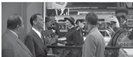
Figure 10.50 Guys and Dolls (1955): Rows of figures fill out the frame and highlight the central information as Nathan Detroit challenges Sky Masterson to date Salvation Army Sarah.