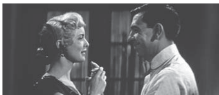
Figure 10.106 A tight Scope two shot, but in the center, there is some out-of-focus movement in the doorway behind ( Pete Kelly's Blues , 1955).