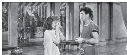
Figure 10.27 The “intimate” two shot in Demetrius and the Gladiators (1954). Compare Figures 10.10, 10.12, and 10.25.