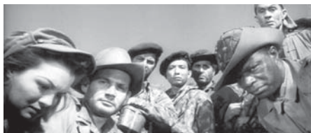
Figure 10.119 China Gate (1957): The squad gathers around a wounded soldier.

flamboyant close-ups of eyeballs and steep low-angle shots with overpowering depth (Figures 10.117–10.118). China Gate (1957) includes simply staged long takes, rhythmically cut jungle skirmishes, posterlike abstraction, and looming wide-angle shots that plunge the camera into the center of the action (Figure 10.119). Fuller's films alone suggest that the Scope era may have been the last period of genuine stylistic variety in Hollywood.