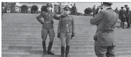
Figure 10.5 Steps that should be parallel are bulging in this shot from The Young Lions (1958).