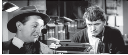
Figure 10.44 Tarnished Angels (1957): A wide-angle composition reminiscent of 1940s style made possible by black-and-white Scope.

between planes. These were easiest to accomplish outdoors, where brilliant sunlight permitted even Bausch & Lomb lenses to achieve robust depth of field. Many of the most remarkable shots in Scope can be found in Westerns, in adventure yarns, in ancient world sagas shot in Italy or Spain, and in contemporary dramas set in the blasting daylight of the Southwest (Figure 10.41). Even under studio illumination, though, some depth was achievable. In the canted framings in East of Eden (1955), shot both on location and in the studio, Elia Kazan seemed to be trying to become the Orson Welles of Scope (Figure 10.42). More discreetly, Delmer Daves relied on the deep-focus look in both exteriors and interiors for his Western Jubal (1956), built out of deep shots reminiscent of film noir (Figure 10.43).