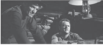
Figure 10.43 A low-key, low-angle framing recalling film noir for Jubal (1956).