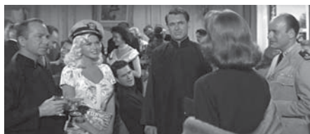
Figure 10.85 Kiss Them for Me : When newcomers arrive, the clothesline layers become slightly more recessive.