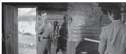
Figure 10.114 . . . does Preminger reveal that Harry has taken it in case Matt won't cooperate.

At the opposite extreme, the tactic of distant depth can put something important plainly in the background and not call our attention to it. The best instance of this I know occurs in Preminger's River of No Return (1954). Early in the film, it's established that Matt keeps his rifle in a holster near the cabin door (Figure 10.111). Later, while relaxing after dinner, the gambler Harry offers to pay Matt to accompany him through Indian territory (Figure 10.112). Matt refuses. He rises, Harry leaves the shot, and Matt reaches mechanically for his rifle (Figure 10.113). Abruptly the rifle protrudes into the frame from the right foreground, in the hands of Harry (Figure 10.114). Preminger has played fair with the audience by keeping the empty holster prominently centered during the whole scene. Those who notice the rifle is missing will experience some suspense, whereas those who do not notice will be startled by Harry's gesture.