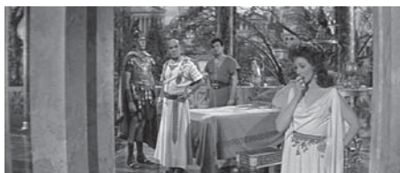
Figure 10.89 Distant depth reminiscent of the 1910s in Demetrius and the Gladiators . Compare Figure 10.9.