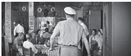
Figure 10.96 Beneath the 12-Mile Reef : Our view of the couple is blocked first by a cop, then by the rival's brawny back, but then we see them moving toward the faraway doorway as he reaches for his knife.