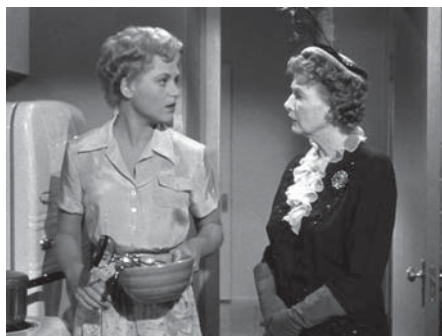
Figure 10.25 The classic two shot remains a basic resource into the 1950s, as shown here in George Cukor's The Marrying Kind (1952).

Such was the menu of staging options in force when Scope appeared in 1953, and the ultra-wide format made mischief with several of them. By 1950, directors had grown accustomed to having the recessive staging option available. But CinemaScope seemed to take it away. No more deep-focus shots taken at vivid angles, with heads dotting the frame high and low. Now the entire frame couldn't be grasped as a single forceful totality. Criticizing widescreen processes, cinematographer Boris Kaufman asserted a classic 1940s premise: "The space within the frame should be entirely used up in composition." 65 It seems likely that Fox's staging recipe worried filmmakers because they had mastered the 1940s recessive schemas, and now those options were banished.