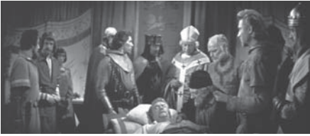
Figure 10.100 King Richard and the Crusaders : Meeting Sir Kenneth's gaze, the conspirators leave, passing behind the crowd in the middle of the frame . . .