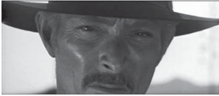
Figure 10.120 Lee Van Cleef, the man with Techniscope eyes, in For a Few Dollars More (1965). (But compare Figure 10.30, which anticipates this framing.)