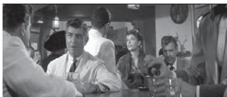
Figure 10.40 Brigadoon : Once the adman protagonist is back in New York, however, the compositions are cramped and closed-off, suggesting stifling metropolitan life.

Zinnemann recalled spending most of his time “inventing large foreground pieces to hide at least one-third of the screen.” 69 Other traditional devices might highlight an item. Lines in the set could link or lead to characters (Figure 10.36). Actors could be framed within corners, columns, and doorways, which broke the big screen into more readable modules (Figure 10.37). 70