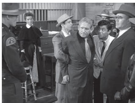
Figure 10.55 . . . and he slips into a gap between characters to put in his version of events.

Shot with a long lens, such a “single” risked losing focus, but at least an off-center face was less likely to contract CinemaScope mumps.