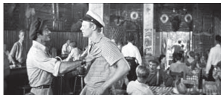
Figure 10.97 Beneath the 12-Mile Reef : The couple rush outside in the distance, but when the fisherman rushes to pursue them down the left aisle, the boy's father halts him in the foreground.

Figure movement in the foreground can be designed to block and reveal faraway niches of action. In Beneath the 12-Mile Reef (1953), sponge fishermen in their local bar are about to fight, but the arrival of the police makes them fake comradeship. To take advantage of it, a young Greek dances out the door with another man's girlfriend, and the drama develops in striking depth (Figures 10.94–10.97). Our vision has to shift from the foreground to a small, out-of-focus background region and then back to the foreground again, in about 3 seconds—and across several feet of screen space, in the original theatrical setting. Putting this sort of demand on the viewer helps energize the experience of long-shot views. King Richard and the Crusaders (1954) shows that as in the 1910s, even a small slot between two players can be activated for dramatic purposes (Figures 10.98–10.102). The technique of wedging story points into the crevices of a dense visual field, all but forgotten today, became reinvigorated in the Scope era.