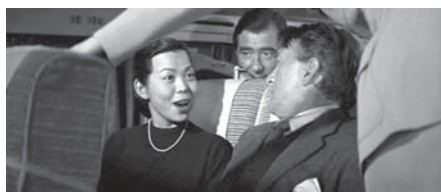
Figure 10.35 Aboard the airplane in The High and the Mighty (1954), the characters are framed by the seat on the left and the stewardess's body on the right.

to today's monstrous faces (Figure 10.30). These have a powerful impact in a scene that otherwise relies largely on distant shots and deep space (Figure 10.31). Likewise, directors who worried about edge distortion placed their action in the central half or three fifths of the image. Now and then, though, key elements would be thrust to the very side of the frame, to create dramatic tension or to induce the viewer to scan the shot actively (Figures 10.32–10.33). Even Koster, once out from under The Robe , tried his hand at edge framing (Figure 10.34).