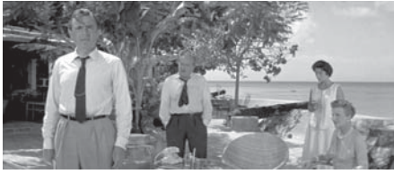
Figure 10.78 In Island in the Sun (1957), the colonial family argues about their family secrets, now exposed in the newspaper. The brilliant daylight allows many planes of distant depth to be activated.