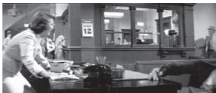
Figure 10.32 The bank robbery in Violent Saturday (1955) makes ambitious use of edge framing. As a bank officer dives under his desk and a customer shrieks, one of the thieves stands poised at the right side of the frame.