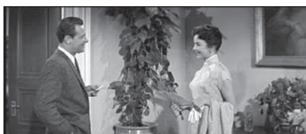
Figure 10.28 A first meeting, rendered in another two shot ( Love Is a Many-Splendored Thing , 1955) that leaves large areas to be filled with props and décor.