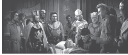
Figure 10.99 King Richard and the Crusaders : A cut to a new angle shows Sir Giles, whom we know is behind the assassination attempt.