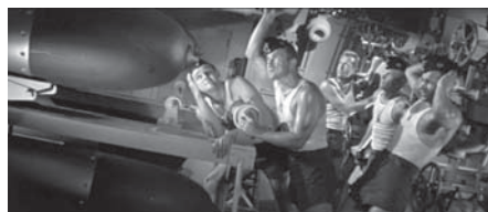
Figure 10.66 Bracing for a hit, the German submarine crew is fanned out like a poker hand ( The Enemy Below , 1957).