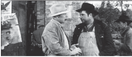
Figure 10.68 A planimetric composition for a late Scope film ( Wild River , 1960).