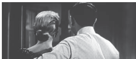
Figure 10.107 Pete Kelly's Blues : Pete and Ivy turn, creating a very unusual shot for Hollywood anamorphic, one more reminiscent of the opening of Godard's Vivre sa vie (1962).