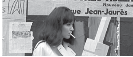
Figure 10.69 Once more, Jean-Luc Godard takes anamorphic matters a step further, creating a Picasso-like collage of ragged strips of space ( Made in USA , 1966).