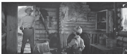
Figure 10.111 River of No Return (1954): Matt, the gun, and its holster.