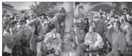
Figure 10.39 In Brigadoon (1954), the shots spread out the mythical Scottish town in a fresco of dance and color.