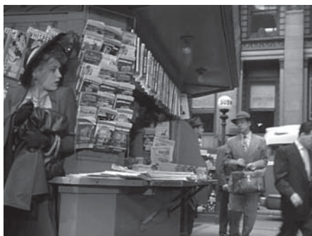
Figure 10.26 In Adam's Rib (1949), Cukor also accedes to the new impulse: A wife trailing her husband is caught in a sharply angled depth shot on location.