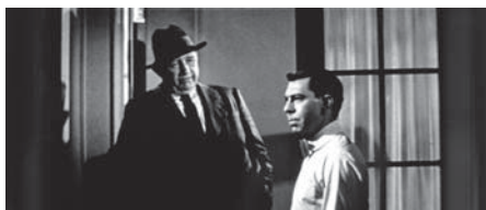
Figure 10.110 Pete Kelly's Blues : George questions Pete, who refuses to cooperate. The shot has peeled away a layer of space in a suspenseful gesture.

exactly the opposite point in space—letting Coley be flung out from the doorway into the audience's face—but Sturges' arrangement activates our awareness more keenly, forcing us to attend to a small parcel of the screen surface.