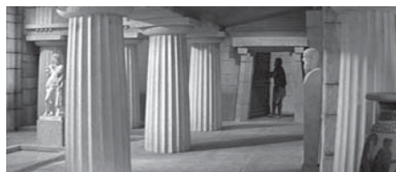
Figure 10.6 CinemaScope made classic columns look bloated, although some set designers tried to disguise the distortion by adjusting the curve on the set ( Alexander the Great , 1956).