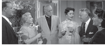
Figure 10.57 . . . to be filled.