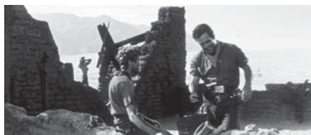
Figure 10.90 A distant silhouette framed for saliency ( Ride Lonesome , 1959).