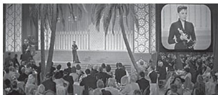
Figure 10.61 A Star Is Born : The TV camera coasts in at frame left, recalling the earlier scene's interplay of film and television.