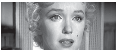
Figure 10.30 An unusually big close-up for early Scope ( Bus Stop , 1956).