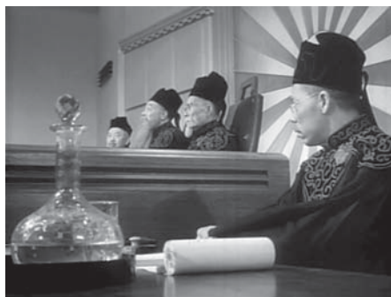
Figure 10.21 A tight composition from The Purple Heart (1944). The precise alignment of props and players, particularly the foreground judge's head, is typical of post- Kane American cinema.