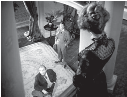
Figure 10.17 Depth-oriented directors could take advantage of the nearly square proportions of the Academy ratio to build up vertical compositions ( The Little Foxes , 1941).

Another set of options appears sporadically during the silent era and the 1930s, but it becomes more prominent in the 1940s. Employing what art historian Heinrich Wölfflin calls “recessive” composition, a scene could be staged along diagonals. 63 Recessive staging activates depth, placing one character notably closer to the camera than the others (Figure 10.15). The depth can be relatively shallow or quite steep. Sometimes the diagonal option gives us two or more distinct playing areas. We may have independent actions taking place in both foreground and background (Figure 10.16). The layout may be lateral (foreground on left or right, and background on the opposite side) or vertical (foreground at bottom, and background on top; Figure 10.17).