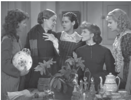
Figure 10.13 Several characters grouped so that their bodies, facing us, fill out the frame on a single plane ( Little Women , 1933).