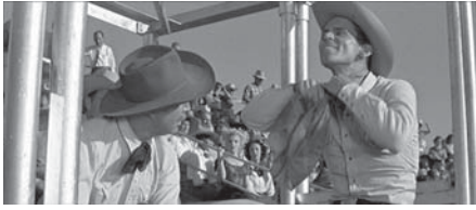
Figure 10.41 The brilliant southwest sunlight of Bus Stop permits striking depth compositions, such as this one showing the cowpoke protagonist tying on the scarf of the woman he loves, while she watches, in frame center, from the stands.