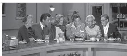
Figure 10.29 Clothesline staging with a vengeance in the soda-fountain epilogue to How to Marry a Millionaire (1953).

creating a gulf in the center and turning an intimate encounter into a more detached one (Figure 10.28). Add more characters, and you're likely to follow the line of least resistance: an almost comical clothesline composition (Figure 10.29). The clumsiness of such shots is implicit in Cukor's worry about directing strings of people. Having taken away the deep-space schemas of the previous decade, Scope also made the traditional planar arrangements look embarrassingly artificial. “Nobody stands in rows.”