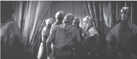
Figure 10.102 King Richard and the Crusaders : When they turn and leave, the camera pans with Kenneth as he follows them out, revealing new layers of men outside.