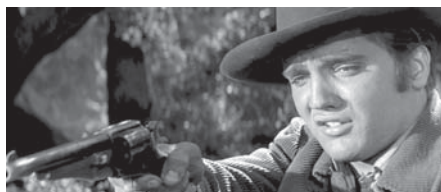
Figure 10.46 Elvis gets Scope mumps ( Love Me Tender ).