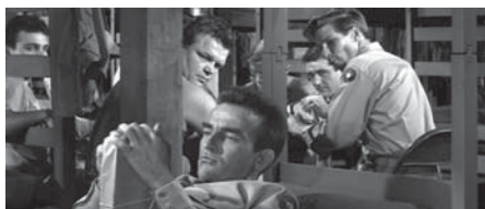
Figure 10.45 A composition even more tightly articulated than Figure 10.21, in black-and-white Scope ( The Young Lions ).