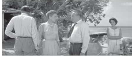
Figure 10.79 Island in the Sun : As they quarrel, characters advance, cross the paths of others, and turn from the camera . . .