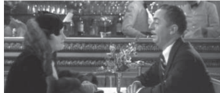
Figure 10.123 The two shot becomes a standard Scope composition; compare Figures 10.28 and 10.70.

Huston's looks like a relief map of the Dakota badlands. 90 But complaints couldn't stop the march of a new style that featured big heads (isolated in singles), unfettered camera movement, and fast cutting. Although the clothesline layout remained the default for much Scope filming, and indeed widescreen shooting in general, into the 1960s, directors soon began to abandon the two shot and rely on recessive layouts, singles, and OTS framings. More intricate staging options began to wane, and what I've called "intensified continuity" began its long rule of Hollywood screens. 91