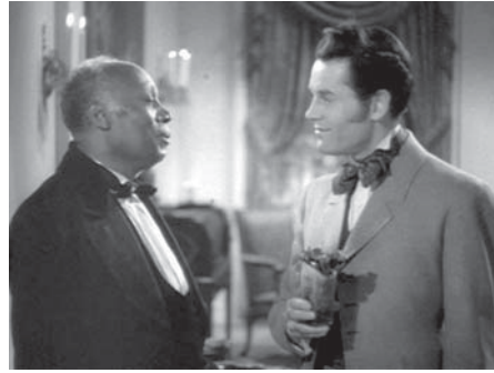
Figure 10.12 The linear two shot persists as a staple of sound cinema ( Jezebel , 1938).