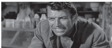
Figure 10.3 Richard Egan suffers CinemaScope mumps in Love Me Tender (1956).

$25 million worldwide, making it the top grosser of the year and one of the highest-earning films of the decade. The other CinemaScope pictures released in late 1953 also did very well. Although Scope was estimated to add an average quarter of a million dollars to a production budget, producers came to believe that the expense was worth it. The no-star adventure Beneath the 12-Mile Reef took in almost $6 million internationally. By the end of 1954, all studios except Paramount (home of VistaVision) had licensed the format from Fox. 24