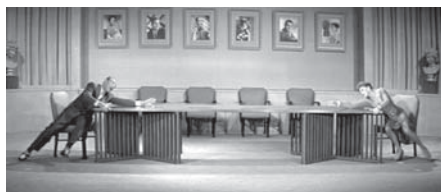
Figure 10.51 The “Glorious Technicolor” sequence of Silk Stockings (1957) mocks the impossible ratio.

cutting rates and some of the image schemas that had become familiar in the 1940s. The goal—to make cinema in the 2.35 ratio as much like that in the 1.33 ratio as possible—was being achieved. Even Charles G. Clarke gave in. His cinematography on Flaming Star (1960) yields plenty of singles, close shots, and camera movements, and the average shot length is a brisk 6.8 seconds. Clarke’s tacit repudiation of the Fox aesthetic is one sign that traditional techniques of cutting and framing had absorbed Scope.