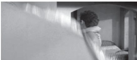
Figure 10.72 Bonjour Tristesse : The beach umbrella he's holding drops forward, momentarily filling the frame with brilliant blue before revealing the couple behind.