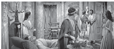
Figure 10.76 The Robe : After a cut-in to Marcellus and Diana, we return to the master shot as Simon Peter comes in. The doctor in the foreground swivels as Marcellus greets John, clearing a space for him . . .