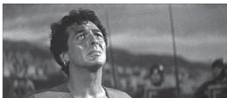
Figure 10.52 The off-center single shot, implying action taking place off frame ( The Robe , 1953).