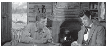
Figure 10.112 River of No Return : Later, in a scene with the gambler Harry, the gun is gone, but we're unlikely to notice.