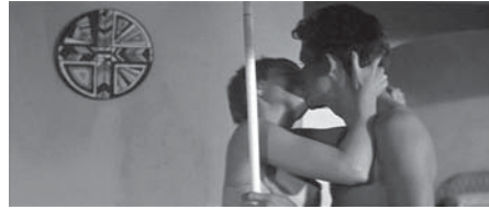
Figure 10.71 Bonjour Tristesse : Carried away by the idea of Anne's happiness, Cécile flings herself into a kiss with Philippe.