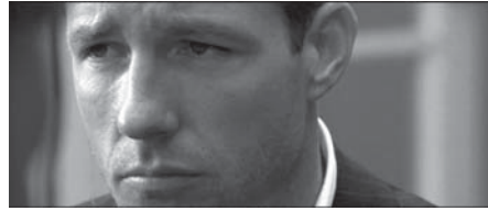
Figure 10.121 A similarly cropped shot from Confidence (2002).