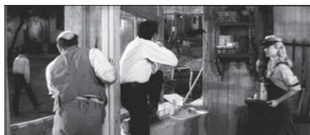
Figure 10.92 Fuller combines modular composition, edge framing, and distant depth in Forty Guns (1957).