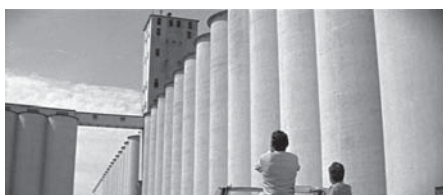
Figure 10.67 The Scope frame as an abstract slice of space ( Picnic , 1955).

The partitioning strategy tends to treat the screen not as a wraparound window on a large chunk of reality but rather as a surface to be broken into rhythmic units. This tendency can be heightened when the director emphasizes shapes, color contrasts, and other pictorial features. The result comes close to an abstract configuration of elements. Even the tiresome biblical spectacular can be assigned a majestic geometry (Figure 10.65). The Enemy Below (1957) largely treats the interiors of its submarine as a nest of rectangles cradling its crew, but just before impact the men's bodies are fanned out like the fingers of a hand (Figure 10.66). Picnic , one of the most arresting 1955 Scope releases, has many points of interest, including daring close-ups and flamboyant depth staging, but it's also noteworthy for its commitment to pictorial abstraction. Joshua Logan and master cinematographer James Wong Howe provide bold compositions outside and inside Midwestern grain elevators (Figure 10.67).