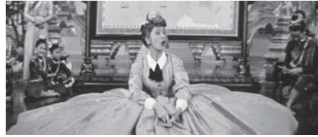
Figure 10.127 Getting to know her students, the hired tutor Anna spreads her vast dress across the CinemaScope screen ( The King and I , 1956).

As with every innovation, the fact that anamorphic imagery is no longer a problem has its benefits as well as its costs. Panavision opened new possibilities for all-over composition in the anamorphic ratio, that maximal use of the screen format that Boris Kaufman valued. Many directors have taken advantage of it, assuming that their densely composed images would be displayed in full (Figure 10.126). And in fairness, I have to say that most directors today face problems no less pressing than the Scope format. How can one develop computer-driven spectacle? Or make full use of digital sound? Or endow children's fantasy, high school comedy, teenage horror, and comic book superheroics with freshness, beauty, and intelligence? Most of these tasks weren't on the agenda for filmmakers of the 1950s.