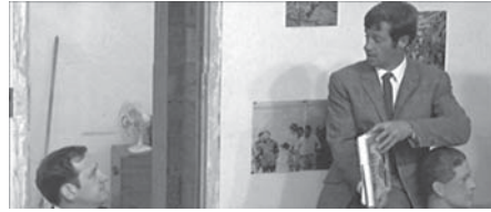
Figure 10.2 Godard seems to take this schema as the visual premise for this shot from Pierrot le fou (1965), which features one head at far left and a clone (actually a sculpted head) at far right.

William Wyler, the Young Turks of Cahiers du cinéma ventured to differ from their mentor. They sang the praises of width. Jacques Rivette discovered that the greatest directors of the past had laid the foundations of widescreen imagery by seeking