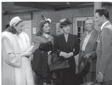
Figure 10.23 Films shot on color stock, which needed more light and didn't allow for great depth of field, continued to favor the clothesline layout ( Leave Her to Heaven , 1945).

usually associated with big sets, having the camera hug the axis of action also permitted sets to be more compact (Figure 10.20). In general, 1940s compositions became tighter, as the urge to fill the frame created layouts that click neatly into place (Figures 10.21–10.22). Because the 1.33 frame was firmly established as the standard, directors could count on their clenched compositions being retained in most movie houses.