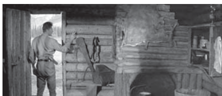
Figure 10.113 River of No Return : Only when Matt reaches for it out of habit . . .