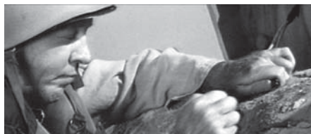
Figure 10.48 Panavision lenses permit a close and full-frame composition in Underwater Warrior (1958).