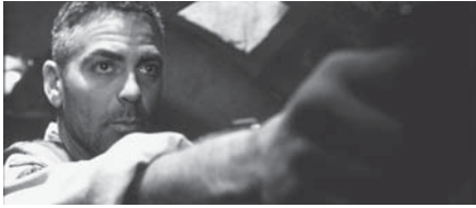
Figure 10.126 Filling the anamorphic frame in Three Kings (1999).