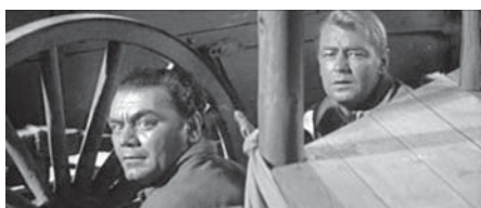
Figure 10.64 Geometric background elements frame characters in medium shot ( The Badlanders , 1958).

mission rather than given a decent burial. The officer who has proposed the mission has turned discreetly away (Figure 10.62). The angled depth recalls the 1940s, but in the 1.33 era, the players would have to be jammed together, and the result would seem airless and perhaps overwrought. The 2.35 proportions allow Neame to create “zones of silence” that respect the solitude of each man while still letting us see the father’s agonizing choice play out over his face.