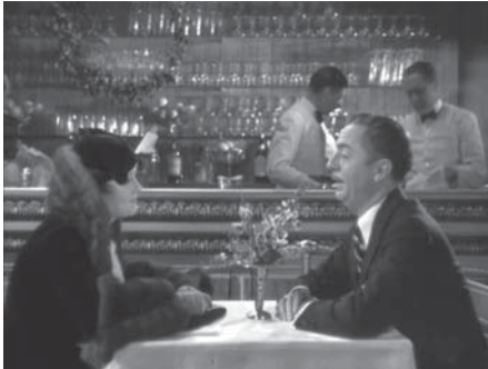
Figure 10.122 A two shot from The Thin Man .