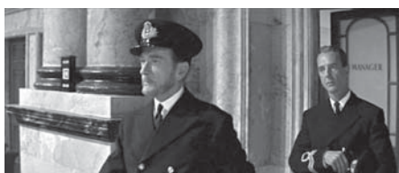
Figure 10.7 The Man Who Never Was (1956): The officer on the right is made abnormally thin by the anamorphic distortion.

the anamorphic attachment in front. Director Henry Koster recalled that in looking at the rushes, about half the shots showed actors out of focus. Immobility was the best solution: “If we kept the actors in the same spot, the focus was all right.” 37 Scope sets were bigger than usual, and the Chrétien lenses, even modified by Bausch & Lomb, were poor at gathering light, so cinematographer Leon Shamroy had to flood the Robe sets with intense arc illumination.