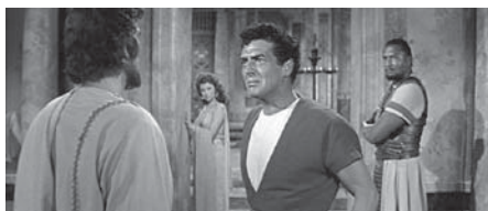
Figure 10.74 Midrange depth in Demetrius and the Gladiators , with characters at different distances from the camera.