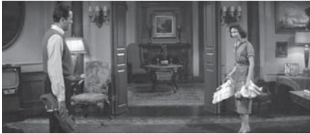
Figure 10.58 The Man in the Gray Flannel Suit (1956): Scope breadth to dramatize a couple's fraying marriage.