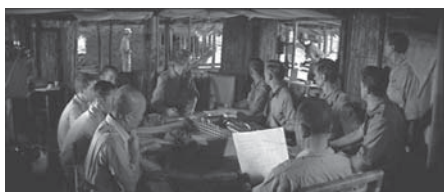
Figure 10.93 The Bridge on the River Kwai : Saito's order is passed down the chain of command, farther and farther into the distant buildings.

perhaps the most striking invention—or perhaps we should say rediscovery—facilitated by Scope: a kind of return to the 1910s, when filmmakers exploited the rich possibilities of midrange foregrounds and remarkably remote background planes. (See Figures 1.1–1.2.) For example, in Demetrius and the Gladiators (1954), the devious Messalina comes into the (already quite distant) foreground while her husband and Demetrius study her from the terrace fairly far back (Figure 10.89).