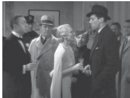
Figure 10.14 Stacking rows: A crowded scene in The Thin Man (1934) still obeys the clothesline principle, in layers.

in not one but two rows, one behind the other but still more or less 90 degrees to the lens (Figure 10.14). These “clothesline” arrangements, spreading several players across a perpendicular plane in profiled or fairly frontal views, became a basic technique for dialogue scenes of 1930s cinema.