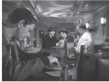
Figure 10.19 The “baroque” side of recessional staging ( The Killers , 1946). Such compositions can be found throughout world cinema in earlier decades, but they became far more common during the 1940s.

compensating maneuver is to turn the foreground actor toward us, motivating this as the character’s refusal to face the other figure. The frontally positioned foreground character became a common device in 1940s dramas, allowing us to see what the background character can’t. In either type of staging, the action can develop along the diagonal, with characters moving toward or away from one another, perhaps in zigzag paths as well. This schema is well suited to building suspense and heightening tension, so it’s not surprising that thrillers and psychological dramas are its natural home.