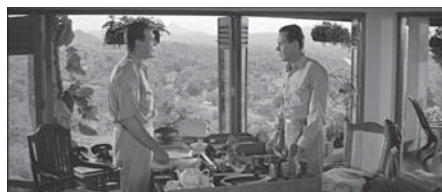
Figure 10.37 The Scope frame broken into two symmetrical chunks by windows framing the characters in The Bridge on the River Kwai (1957).