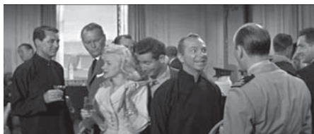
Figure 10.86 Kiss Them for Me : And as the group breaks into conversing pairs, their mild recession is broken by a woman towing a man through along a slightly opposing diagonal.