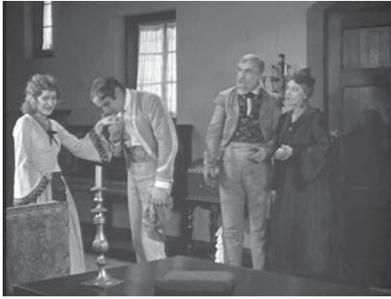
Figure 10.11 Even in a long shot, characters line up more or less in clothesline formation ( The Mark of Zorro ).