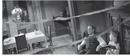
Figure 10.42 Elia Kazan cants the Scope frame throughout East of Eden (1955). Here it creates a dynamic depth composition, with Cal outside while his father and Abra wait at the party inside.