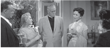
Figure 10.56 Love Is a Many-Splendored Thing : A clothesline array leaves a vacancy on the right . . .