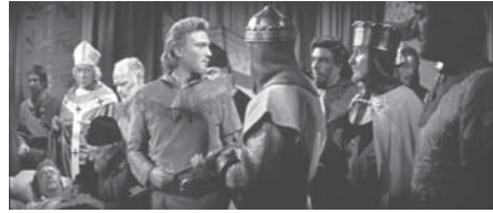
Figure 10.101 . . . before stopping in a gap to confront Sir Kenneth's suspicions.