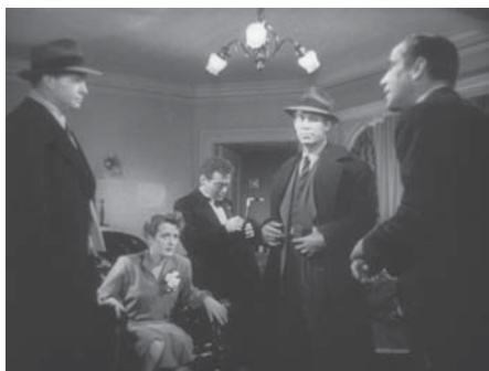
Figure 10.20 Small and rather cheap Warner Bros. sets are well concealed by recessive layouts of figures in The Maltese Falcon (1941).