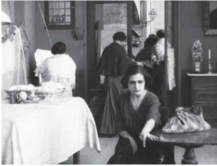
Figure 10.9 Although lining up characters in a row perpendicular to the camera was the most common staging strategy of the 1910s, Assunta Spina (1915) exemplifies one sort of depth that was also employed. The foreground plane is fairly far from the camera, making the action in the background quite distant. For other examples, see Figures 1.1–1.2 and 9.1–9.5.