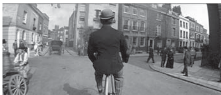
Figure 10.8 Massive warping of space in the opening of Around the World in 80 Days (1956). The aberrations were less noticeable on the huge, steeply curved Todd-AO screen.

As filmmakers began to discover the format's drawbacks, it needed more defending. For a 1955 issue of American Cinematographer , the erudite director of photography Charles G. Clarke provided a guide for shooting in Scope. Fox republished the piece as a pamphlet to be given to workers at other studios. 55 Acknowledging that people have voiced reservations, Clarke's essay tries to revise the official line. He points out that the equipment has improved; there are now single-unit lenses in five focal lengths (from 35mm to 152mm). Longer lenses make close-ups more feasible, because the camera doesn't need to be moved close to the actors, but (perhaps granting the focus problems with the long lens) Clarke recommends other options. Instead of big close-ups, two shots are quite adequate in Scope: "The figure size of the 'two-shot' is larger than was the 'big head' on the older, smaller screen." 56 If you feel the need for a close-up, an over-the-shoulder (OTS) shot favoring the character will do the trick.