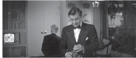
Figure 10.59 A Star Is Born (1954): Television versus cinema, balanced at opposite ends of the frame.

ters can be stationed at opposite edges of the image (Figure 10.58). Other filmmakers use the horizontal sweep more delicately, as Jacques Rivette predicted: