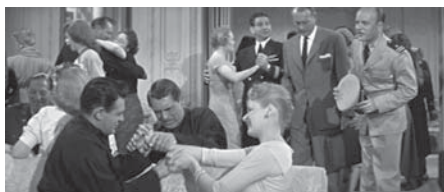
Figure 10.84 Somewhat like Jacques Tati's restaurant scene in Play Time (1967; Figure 7.15), the party in Kiss Them for Me (1957) creates layers of distinct actions.