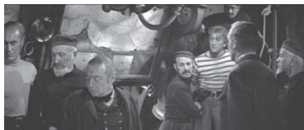
Figure 10.87 At the end of one shot of 20,000 Leagues Under the Sea (1954), all look off, awaiting the entrance of Captain Nemo.