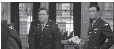
Figure 10.34 As the officer in the center realizes that his rival has been promoted, we're expected to notice the new star on the man's shoulder, at extreme left ( D-Day the Sixth of June , 1956).