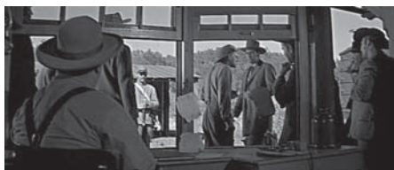
Figure 10.91 The Great Locomotive Chase (1956): A busy foreground and partial views through apertures, another strategy characteristic of 1910s cinema as well.