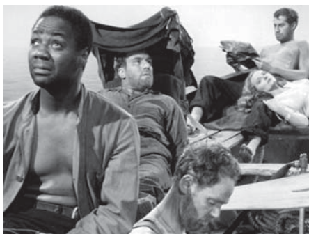
Figure 10.24 Alfred Hitchcock experimented with recessional compositions after coming to America; this striking shot is from Lifeboat (1944).