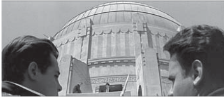
Figure 10.115 California sunshine allows Nicholas Ray to produce one of the most exciting compositions in early CinemaScope, as the gang member's switchblade rises ominously up from the lower frame edge ( Rebel Without a Cause ).