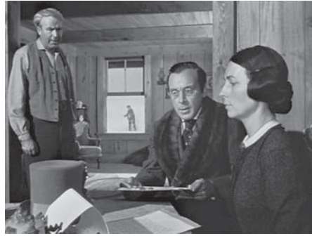
Figure 10.16 Citizen Kane (1941) made extreme depth staging central to its aesthetic; here Mrs. Kane signs her son away to a guardian while the boy plays outside unawares. This shot, like several in the film, was achieved through a rear-projected film of the boy seen through the window.