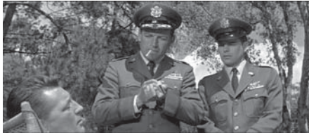
Figure 10.1 In situations when some actors were sitting and some were standing, CinemaScope close views posed problems, and some directors opted to chop out a body, leaving a head at the lower frame line ( The Hunters , 1957).