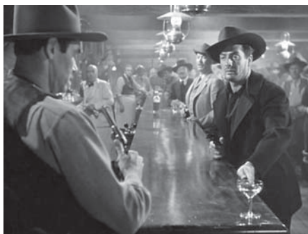
Figure 10.22 John Ford favored bold depth compositions from the very beginning of his career. Here Wyatt Earp in the foreground is about to slide his pistol down the bar to his brother under the nose of Doc Holliday ( My Darling Clementine , 1946).