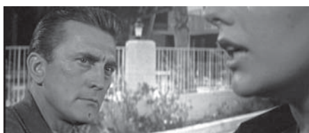
Figure 10.49 Strangers When We Meet (1960): Panavision renders good focus, in close-up and color.

A second pressure toward normalization has already appeared in our story: the emergence of Panavision. The new system was sold largely on its ability to provide acceptable close-ups (Figures 10.46–10.47). Panavision’s president had claimed that stars would soon refuse to appear in Scope films because the lens made them look fat. 79 In winning an Academy Award for Scientific or Technical Achievement in 1958, the process was praised for its ability to “substantially reduce photographic lateral distortion and thereby improve close-up quality and overall definition.” 80 A bonus, however, was the ability of Panavision lenses to handle recessive staging without loss of focus. Early (and uncredited) Panavision films, mostly black-and-white projects, display remarkable close-ups and depth of field (Figure 10.48). Soon Panavision was offering a range of specially made lenses that could render depth of field far more crisply, and when the process was used for color, the results were impressive as well (Figure 10.49). By the early 1960s, the big-foreground wide-angle look was attainable in widescreen, and Panavision was in the driver’s seat.