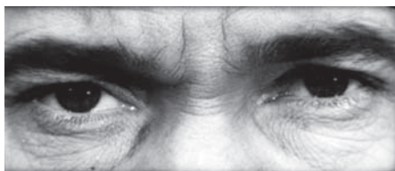
Figure 10.117 A Leone-like extreme close-up in Forty Guns .