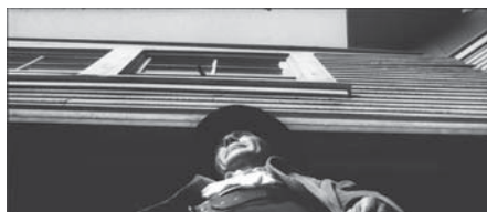
Figure 10.118 Griff steps out into the backyard of a mortuary, with a rifle visible in the window above: an outlandishly low and deep angle from Forty Guns .