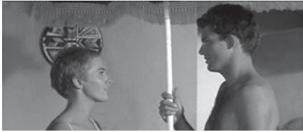
Figure 10.70 Bonjour Tristesse (1958): Cécile and her new boyfriend are talking about Anne, who has started a romance with Cécile's father.