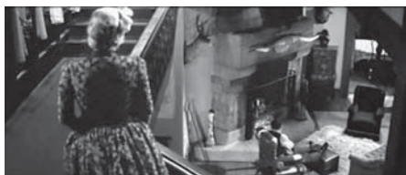
Figure 10.124 Scope turns a vertical space—a ground floor and the stair landing above—into a horizontal one ( The Violent Men , 1955). Compare the Little Foxes staircase (Figure 10.17).