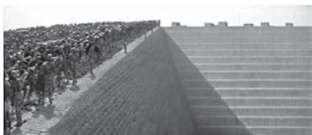
Figure 10.65 Abstract masses in Land of the Pharaohs (1955), with the toiling masses as verticals balanced by striated horizontals.