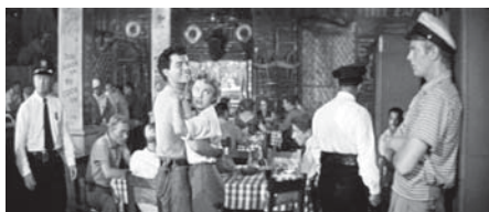
Figure 10.94 Beneath the 12-Mile Reef (1953): As the policemen thread their way through the bar, a young Greek boldly dances with his rival's girlfriend.