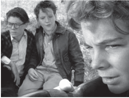
Figure 10.18 A shot from Gun Crazy (1949) exemplifies the extremes to which the deep-space staging of the 1940s could go.