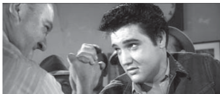
Figure 10.47 Elvis is cured, thanks to Panavision optics ( Jailhouse Rock , 1957).