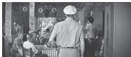
Figure 10.95 Beneath the 12-Mile Reef : The dancing couple drifts further back, and the jilted fisherman steps to frame center, turned from us.