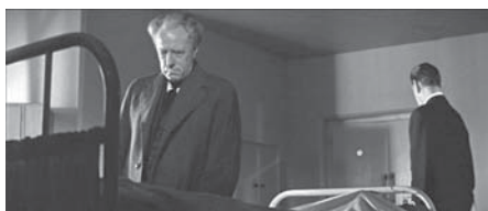
Figure 10.62 A father decides whether to give his son's remains to the war effort ( The Man Who Never Was ).