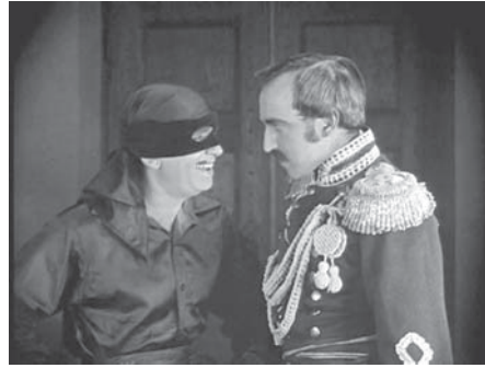
Figure 10.10 A standard medium two shot from The Mark of Zorro (1920).

to restricting close-ups and camera movement, Scope initially induced a crisis in Hollywood staging practices.