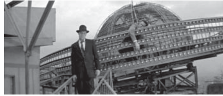
Figure 10.116 House of Bamboo (1955): The climax on the slowly spinning rooftop globe.

All these payoffs couldn't have been foreseen in the "theatrical" agenda promoted by Fox. Yet Scope permitted, and to some degree encouraged, them. By the end of the 1950s, these impulses coexisted with several more traditional schemas, often combining within a single film. Some scenes relied upon the default schemas—little depth of field, clotheslines or shallow staging, partitioning of the frame, and standard OTS shots. Others presented edge framing or surprisingly big close-ups. And any scene might rely on long takes or rapid cutting. For those few years during which CinemaScope was in the ascendant, it was adjusted to the demands of the classical style, but in the hands of imaginative filmmakers, it also yielded uniquely valuable results.